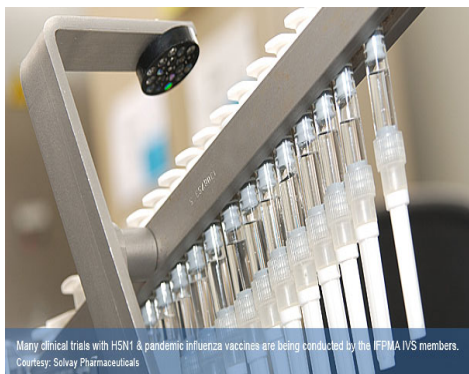
Many clinical trials with H5N1 & pandemic influenza vaccines are being conducted by the IFPMA IVS members.

Future medical developments will depend on continued clinical research & trials. Products Liability normally does not include liability of an unproven, unregulated product in its testing stages. Trials are conducted in phases that can span years animals in early stages and then humans at later stages. All clinical trials are different and there are uninsured liabilities the entire clinical trial stages. It is important to make certain that the Clinical Trials Liability policy you consider are specifically written to cover all the exposures for the anticipated trials.